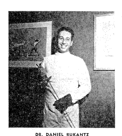
Fencers Club Dedending Champion, Foil